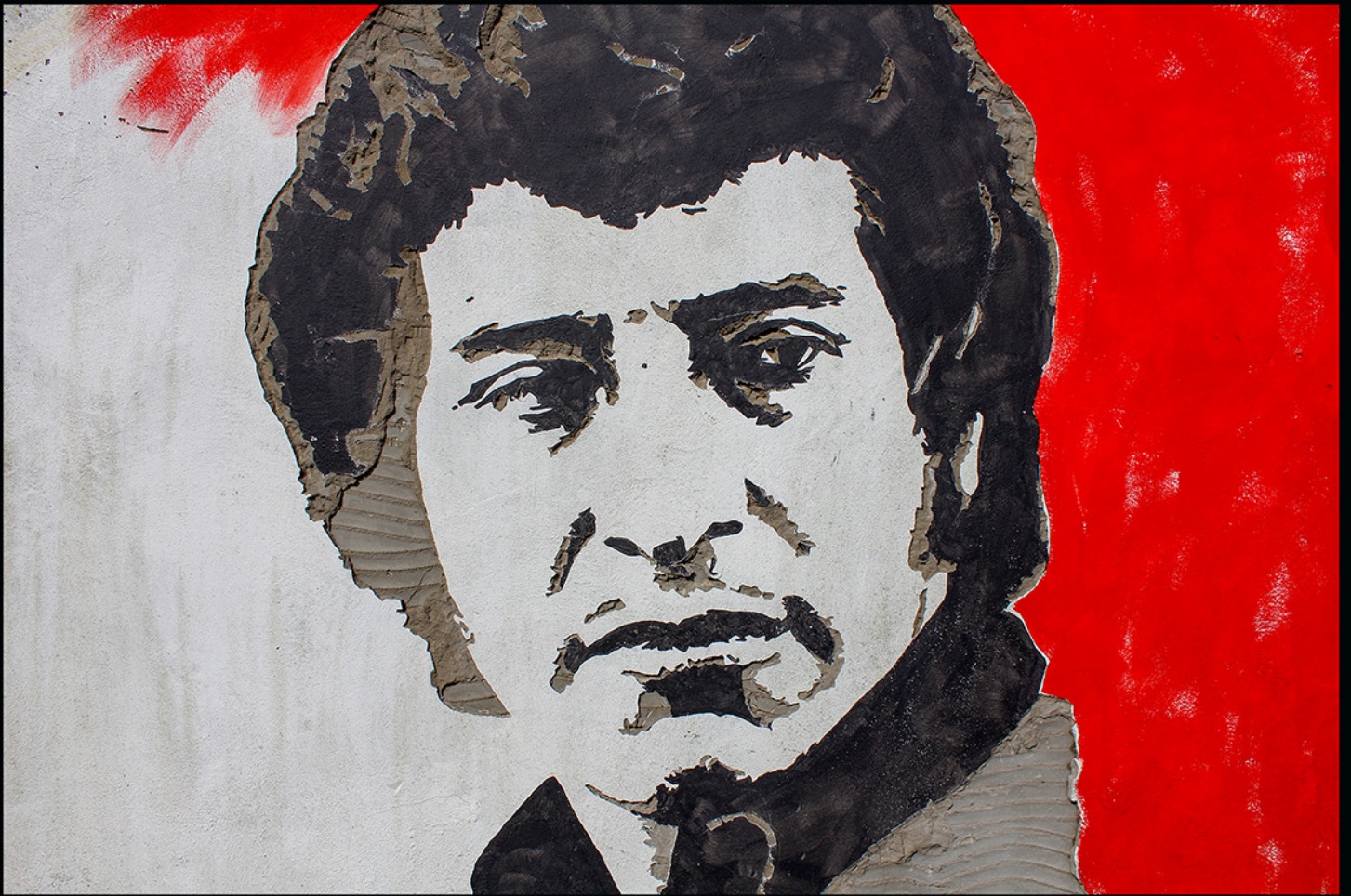
Portrait of Victor Jara carved and painted on concrete wall (2020) Original artwork created for James Dean Bradfield's Even in Exile album cover design