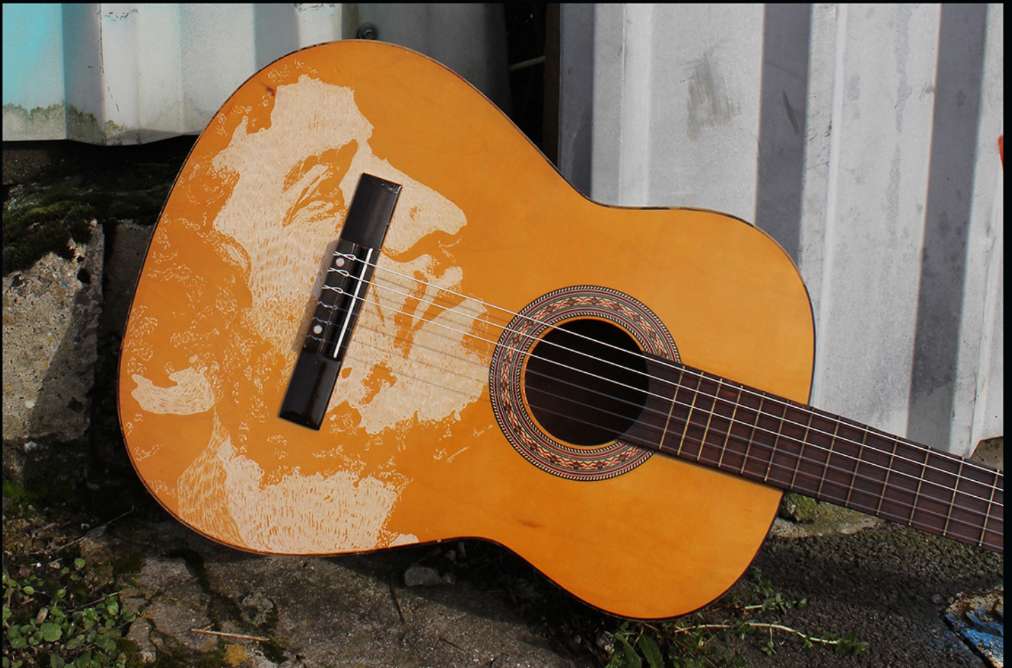
Hand-engraved portrait of Victor Jara on Spanish guitar (2020) Original artwork created for James Dean Bradfield's Even in Exile album cover design