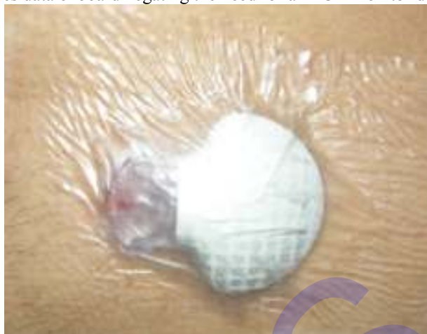
Figure 1. The iPro® CGMS, pictured with sensor (in grey) and digital recorder (in white). The sensor is inserted below the skin, into the abdomen [10].

Continuous glucose monitoring (CGM) has emerged as a tool for patients with type 1 diabetes mellitus to help maintain euglycaemia (normal glycaemic control). The monitors provide information on ambulatory, postprandial and/or nocturnal glucose excursions [7]. In contrast to intermittent self-monitoring of blood glucose, usually via finger stick devices (SMBG), CGM systems (e.g., Guardian® RT by Minimed) allow glucose levels to be measured continuously from a small electrode inserted into the interstitial fluid under the skin. A transmitter sends information wirelessly to a monitor that displays current glucose readings and stores the data for viewing and downloading to a personal computer [8]. Alternatively newer models such as the MiniMed iPro® CGMS (CGMS iPro, Medtronic, Northridge, USA) have a digital recorder attached to the electrode sensor, which stores data onboard negating the need for an LCD monitor display, see Figure 1 below.