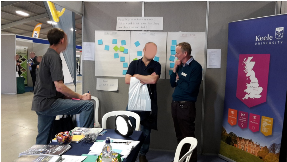
Figure 2 – Flipchart papers to be covered in post-it notes, filled in either at the start or end of an interview. The idea of framing this around risk is useful as an idea generator.