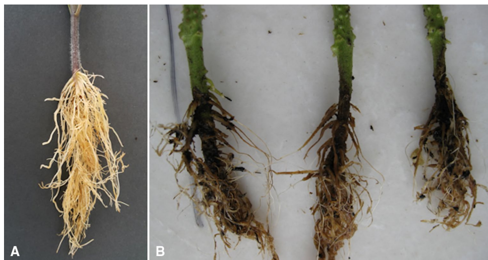
Fig. 1 Healthy and FORL -infected tomato roots. The roots of seedlings at one true leaf stage were washed off substrate, dipped in a suspension of 10^7 spores/ml. Seedlings were then transplanted in

DNA from twenty resistant and twenty susceptible F 2 lines was pooled in equal concentrations to make up the