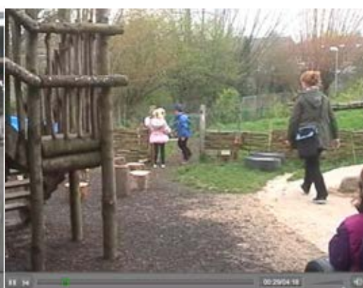
(Fig. 8. CL plays with another child outside)