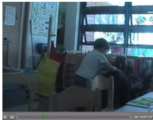
(Fig. 3 Playing with practitioner's hair)

(Speculative explanation) Research by Dupaul et al (2001) supports the view that children with ADHD tend to exhibit more inappropriate behaviour than normal, especially in task situations like that of the one JD finds himself in. However, close up views of JD suggest he may have an eye alignment problem (estropia i.e. crossed eyes)(Children's vision coalition, no date). Although children usually outgrow this, it would help provide an alternative explanation for holding the object so close to the practitioner (fig. 4).