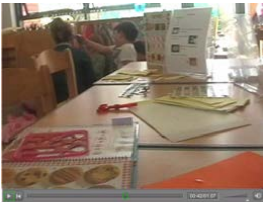
(Fig. 2 holding object too close to face)

is important to develop children's confidence and independence so that they do not feel the need to receive approval all the time. Children need to observe from the outside and learn to make their own decisions; without confidence children can become reliant on reassurance making decisions to suit their observer and avoid disapproval; this can lead to children becoming distracted in the classroom and not reaching their full potential due to the inability to take risks and learn from these (Zucker 1998; Dyer 1998). (Speculative observation) Despite JD tending to be on his own, when he happens to be in group situations where he interacts with peers, he has a tendency to take control and seeks attention. Fig. 2 shows JD putting an object too close to the face of the practitioner and fig. 3 shows JD playing with the practitioner's hair.