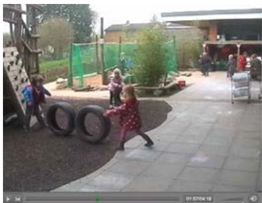
(Fig. 7. CL watches children play with tyres)

more knowledgeable than herself and so watches them in order to construct her own understandings (Miller et al 2010).