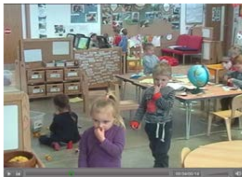
(fig. 5 AD following)

( Starting with a general impression ) AD is an 'English as an additional language' (EAL) child who appears to be disconnected from the other children in the classroom, apart from a girl of about the same age, also EAL, who he seems to spend a lot of time with. He tends to copy this child on a regular basis, even down to her movements and gestures. Although there is little verbal communication between them, she seems to lead the way whether moving around the nursery holding hands or when sitting on a comfortable chair (fig. 5). She is the only child, from watching the clips, that seems to play with AD; other children begin to play and then shortly leave or play alongside (parallel play).