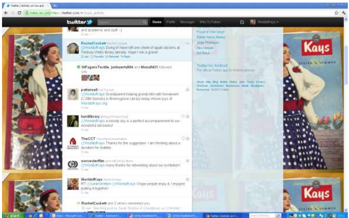
Screen capture from TWITTER.COM/WORLDOFKAYS , (accessed 6 Feb 2012)