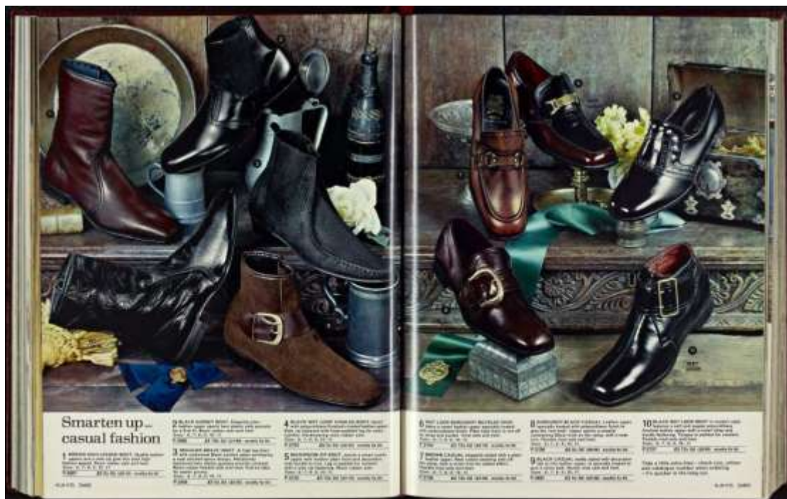
Sample image, showing quality of photography undertaken. Image of men's footwear from the Kays catalogue, Autumn Winter, 1970.

The photographers made every effort to reduce reflection and shine in order to ensure that the images were as clear and legible as possible.