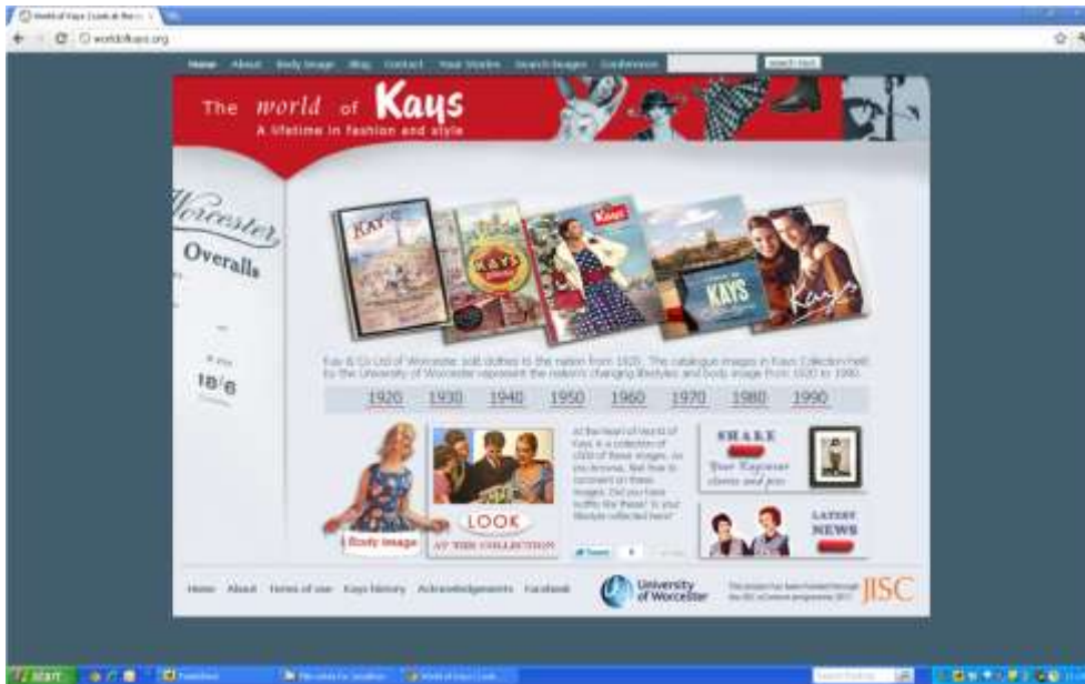
Screen capture of www.WorldofKays.org home page, accessed 15 Dec 2011

The project team tested the website and invited community partners to test it for themselves and to feed back. All comments were submitted to the design team, and alterations made.