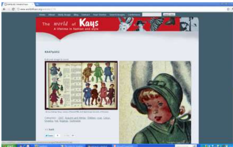
Screen capture of catalogue image on www.WorldofKays.org , demonstrating the high magnification effect enabled by zoomify.com (accessed 15 Dec 2011)

This work was completed by mid-December.