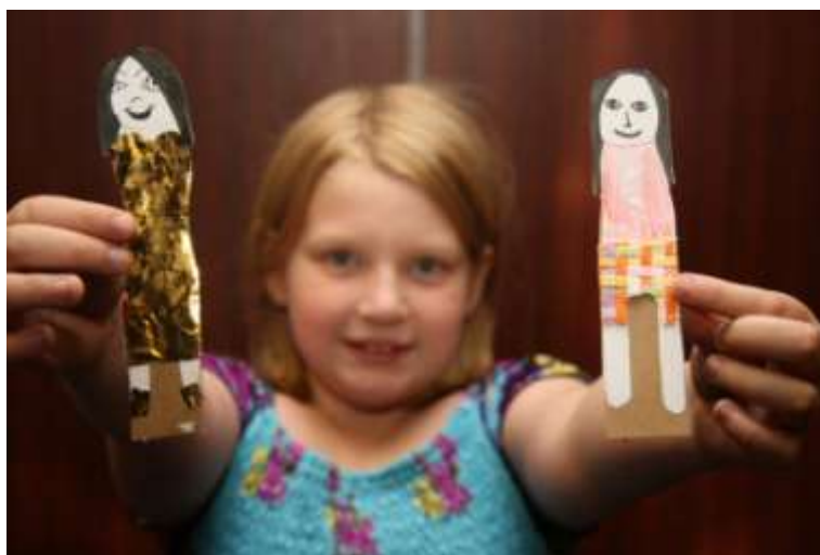
A young carer shows off artwork inspired by World of Kays, Oct 2011

To provide added value and enhance our community content, our community facilitator engaged with adult and young carers through Worcestershire Association of Carers and Worcestershire Young Carers to generate creative media material for the website.