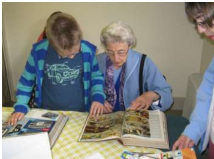
Three generations of the French family reminisce about their experiences of shopping with Kays during the World of Kays Heritage Open Day, 10 Sep 2011

The Coffee & Kays event (20 July 2011) was a catalyst for a very high profile publicity surge which attracted a great deal of attention. During July 2011, the project was featured on