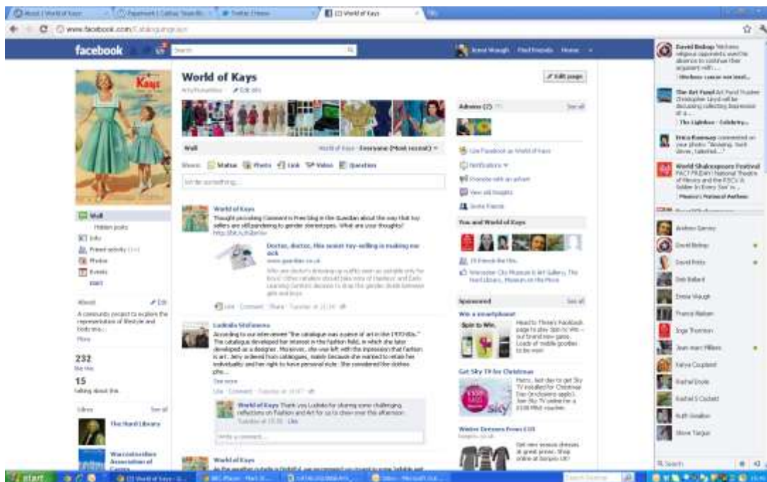
Screen capture of World of Kays Facebook page showing posts from students of the London College of Communication (accessed 15 December 2011)

All audio and film footage recorded is edited and the results embedded on the website blog and tagged as ‘community content’.