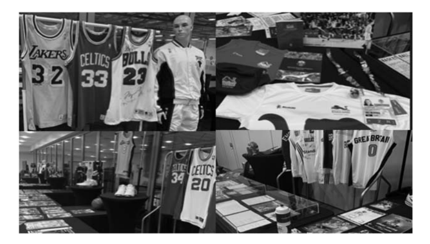
Figure 1. Collation of images from the NBHC exhibit, January 31st, 2020.

Although designed to be temporary (due to the current lack of space for permanent displays and short term use of loaned material), the exhibition success has, invariably, been enabled and enhanced by NBHC's clear, concise, and consistent virtual identity. Firstly, NBHC required an acceptable name that could effectively communicate the Centre's brand and be employed across multiple social media spaces. Initially, the URLs NBHC.com and NBHC.org were available but were premium domain names priced beyond the Centre's financial resources.<sup>34</sup> In the social media space, @BasketballHeritage exceeded Twitter's character limit, so the word basketball was replaced with hoops; a popular slang term for the sport.<sup>35</sup> The Centre eventually settled on www.HoopsHeritage.com for its domain name, @Hoops.Heritage for Facebook, Instagram, and TikTok, and @Hoops_Heritage for Twitter. With significant image and videobased content, currently NBHC disseminates primarily from Instagram with posts simultaneously synchronised with Facebook and Twitter.