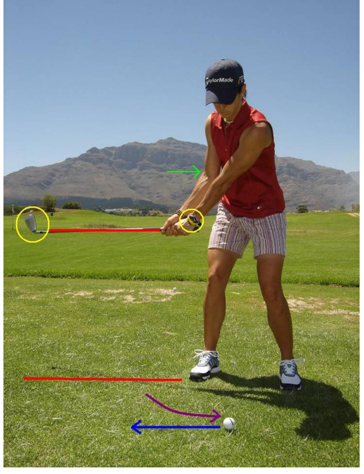
Figure 1. 2D Analysis