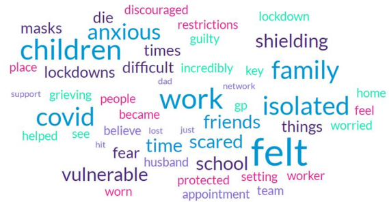
Figure 1 Impact of the pandemic on the mental health of participants

Many TAs clearly felt unsafe at work during the pandemic, and there are concerning comments in the data which allude to a lack of protection for staff, and the anxiety, panic and fear that resulted. Just two examples of many comments are found below: